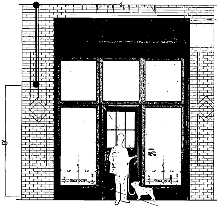
G4A - STOREFRONT LOGOS - ELEVATION SCALE 1/2"=1'