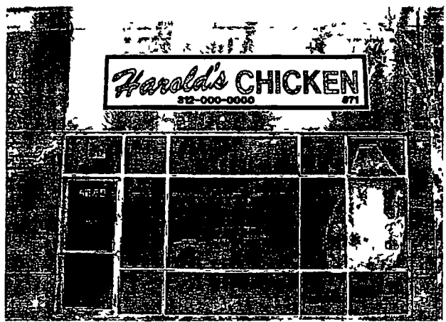
SIGN SHOWN ON 21' STORE FRONT