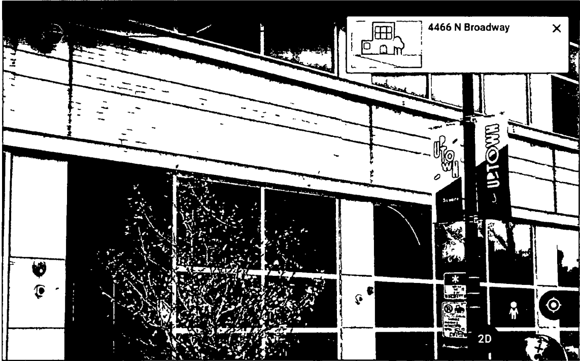
T2373 – Security Camera (N Broadway)