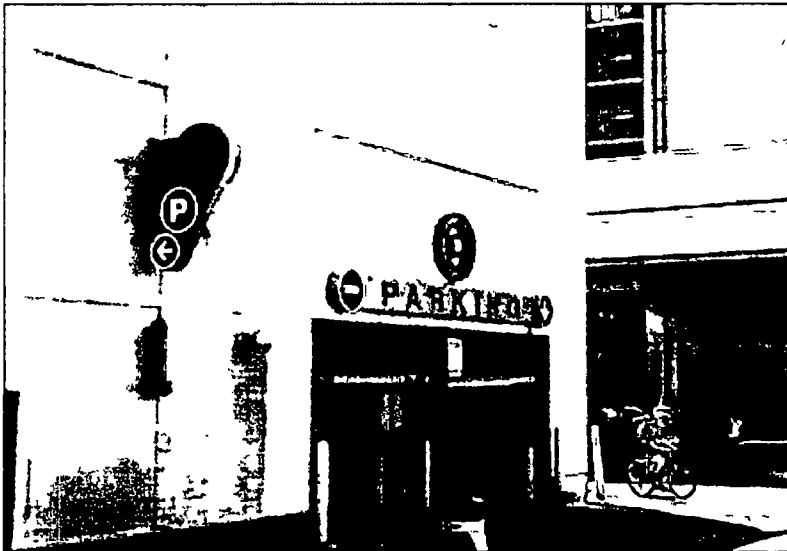
T2373 – Security Camera (W Sunnyside)