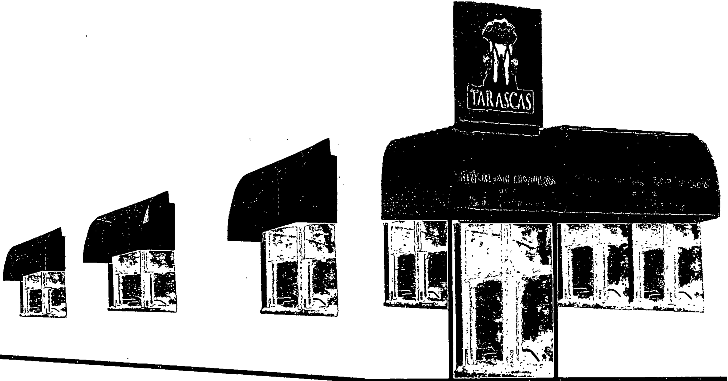
TARASCAS RESTAURANT 2585 N. CLARK CANOPY OF WRIGHTWOOD SIDE