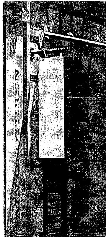
New banner in place