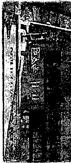
Remove existing banner and scrap

INSTALLATION: Remove existing face from frame, install new face in the same location