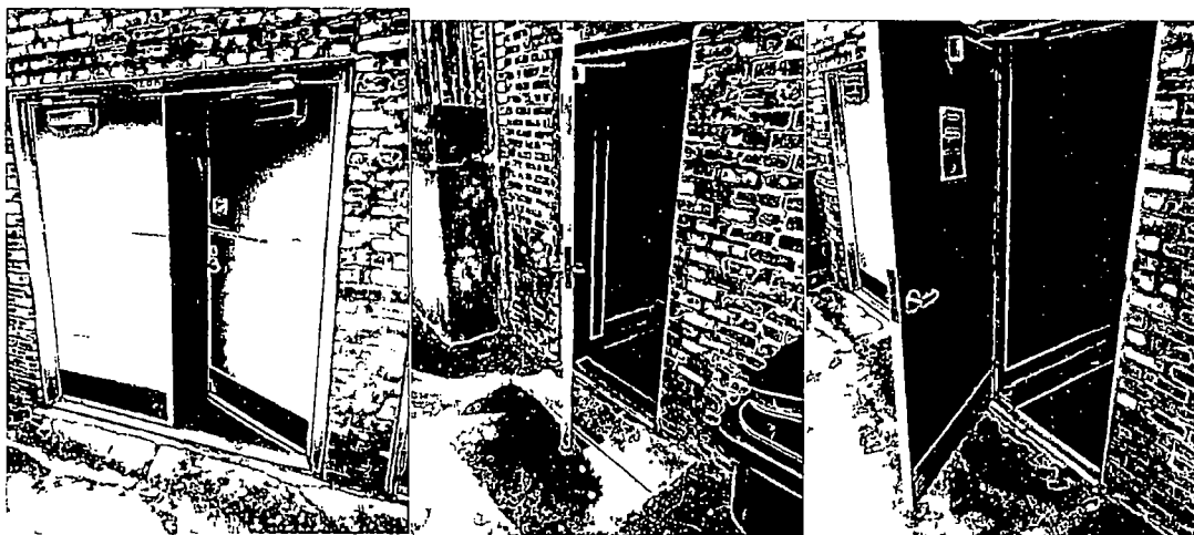
North Alley Door