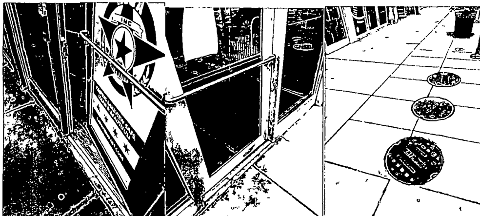
South Retail Space