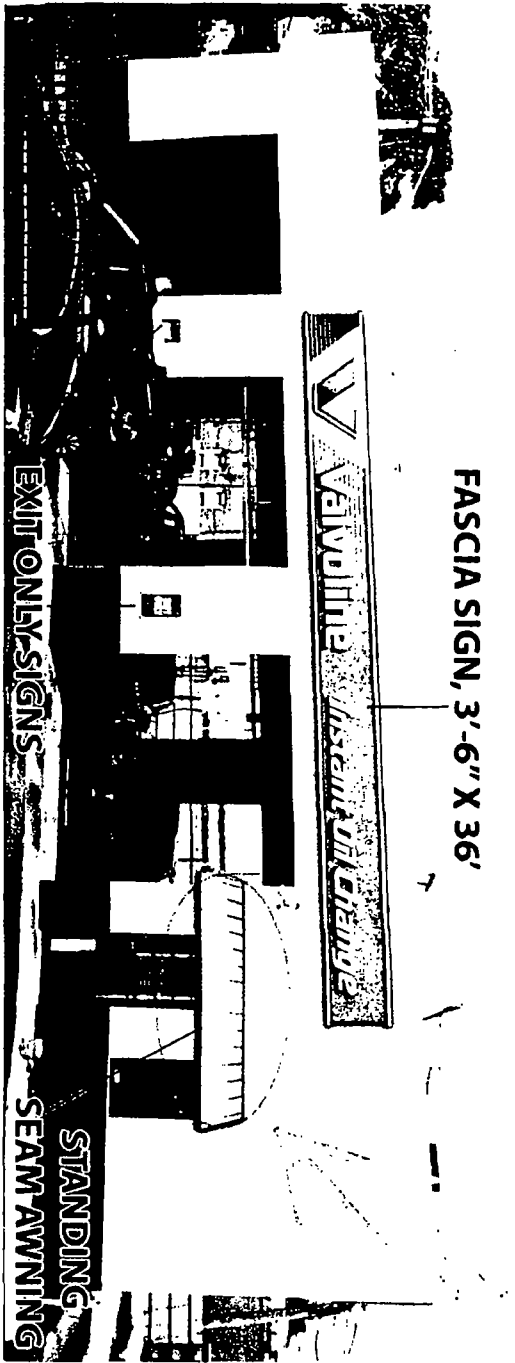
FASCIA SIGN, 3'-6" X 36'