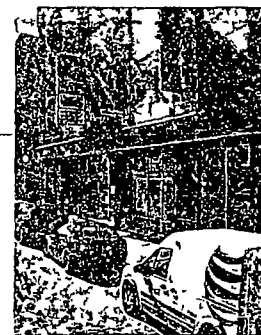
Existing East Elevation NTS