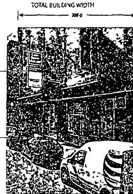
Proposed East Elevation NTS

TOTAL BUILDING HEIGHT 98' 0" BOTTOM OF SIGN TO GRADE 28' 0"