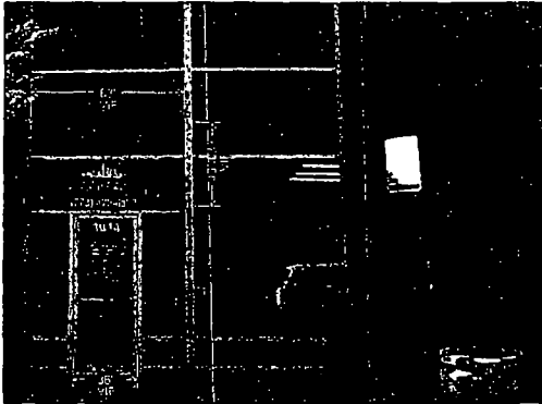
Additional Awning Cover Scale: 1" = 1' 0"

Additional awning cover provided - Stored at client location Grommets for attachment to awning frame