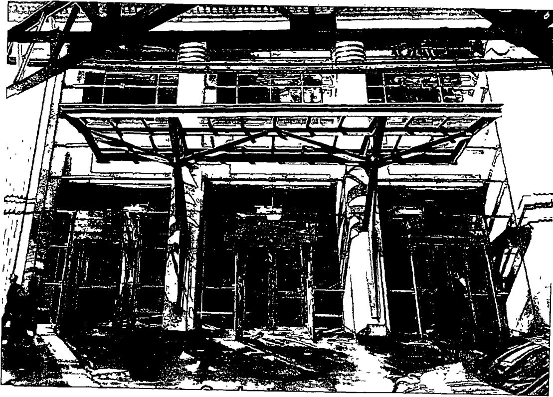
VAN BUREN CANOPY