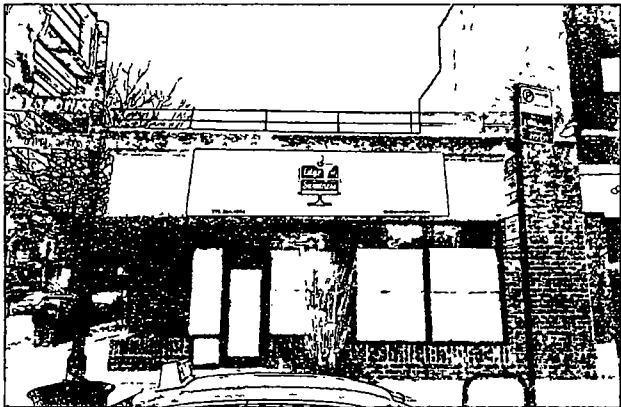
PHOTO FOR VISUAL REPRESENTATION ONLY AND IS NTS

48" X 17' LONG CUSTOM AWNING SUNBRELLA #4651 SILVER WITH 6" RIGID VALANCE AND CLOSED ENDS 36" PROJECTION AND FULL COLOR SILKSCREENED GRAPHICS