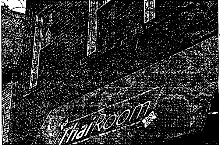
Closeup of Light Fixtures Along Western Ave