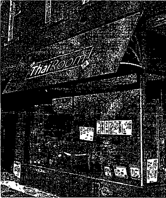
Light Fixtures Along Western Ave