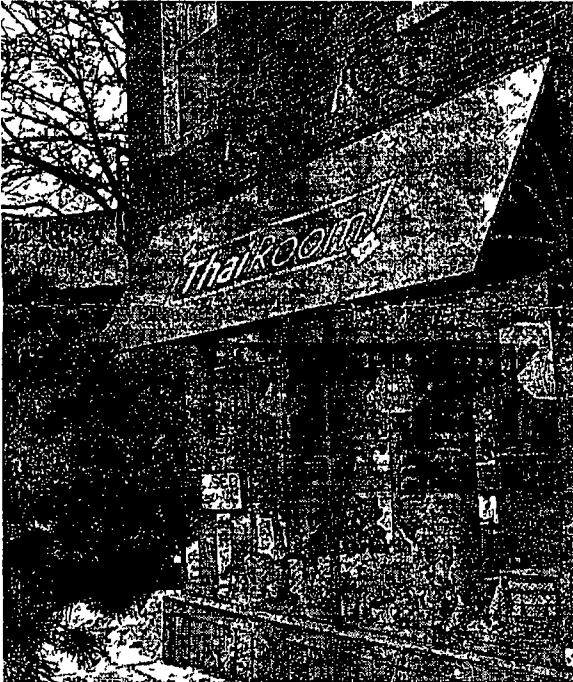
Light Fixtures Along Cuyler Ave