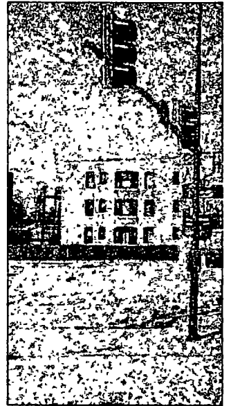
Northwest and 51st!