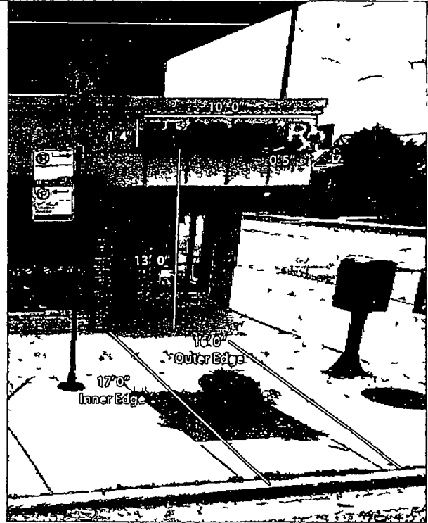
NOTE: Photo for representational purposes only. Signs are not to scale and may appear larger or smaller than shown.

Sign Erector PRO IMAGE 2006 W Chicago, Ave Chicago, IL 60622 Tel 773 292 1111 Fax 773 645 4169