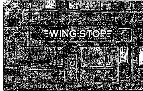
STOREFRONT ELEVATION SCALE: 1/8" = 1'-0"

REPLACE LETTERS WITH 21'-0" CLOTH AWNING WITH WHITE COPY WING STOP LETTERS ON IT. AWNING COLOR: SUNBRELLA FOREST GREEN #4637. AWNING WITH 32" PROJECTION, CLOSED ENDS WITH WING STOP COPY ON EACH END. SOLID 8" VALANCE AREA. 4 GOOSE NECK FIXTURES TO BE. PLACE ABOVE AWNING.