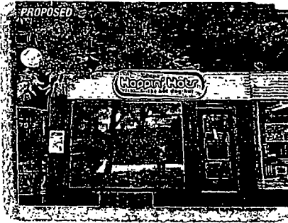
SIDE VIEW DETAIL NTS