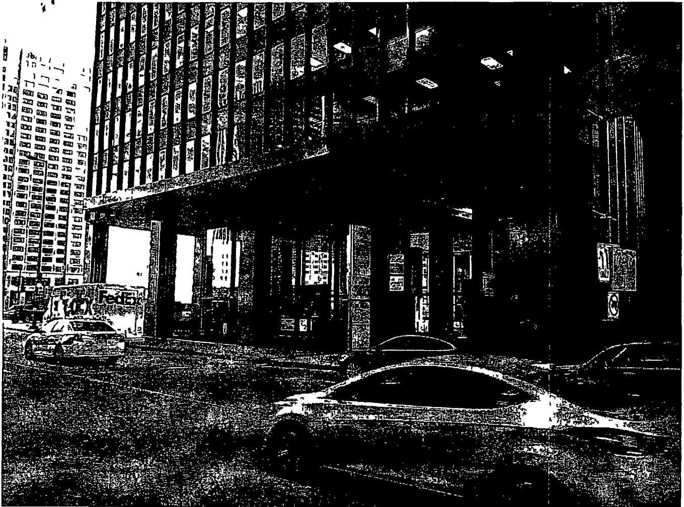
303 East Wacker Canopy photo looking North-East JPG