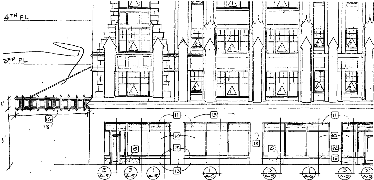
NORTH ELEVATION - BRYN MAWR SCALE : 1/8" = 1'-0"