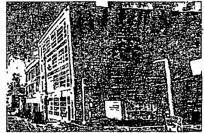
Existing Conditions NTS

Note: Accurate survey will be required to determine proper hardware and installation to building wall engineering may be required