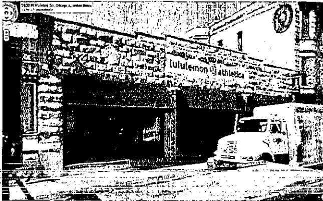
Existing Signage