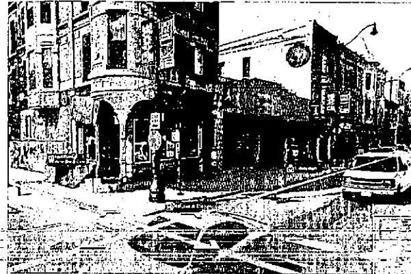
Existing Signage