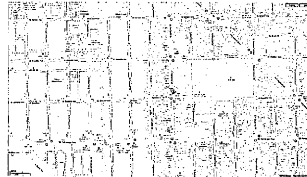
Site Map

100% COMPLETE 75% COMPLETE 50% COMPLETE 25% COMPLETE NOT STARTED