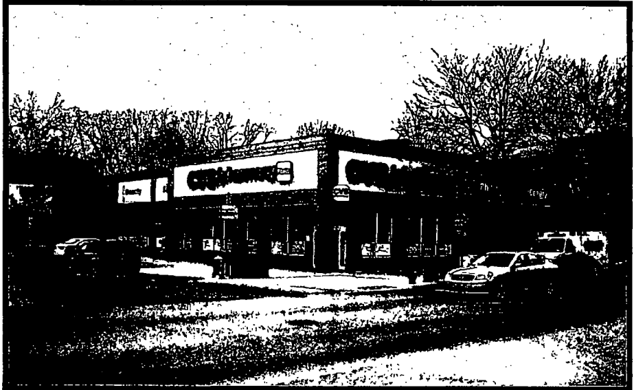
Proposed Signage Overview