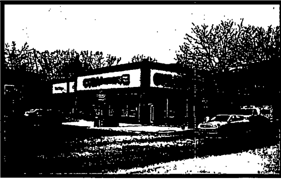
Existing Location Overview