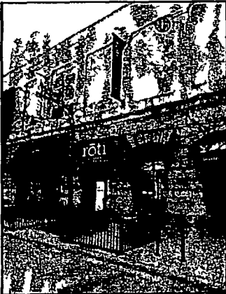
(1) INSTALLED ON CLINTON STREET SIDE