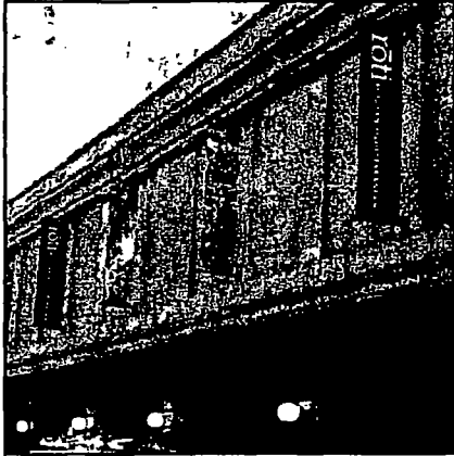
(2) INSTALLED ON CANAL STREET SIDE

(3 REQ.) Q/F PERMANENT BANNERS AS SHOWN WITH MOUNTING HARDWARE