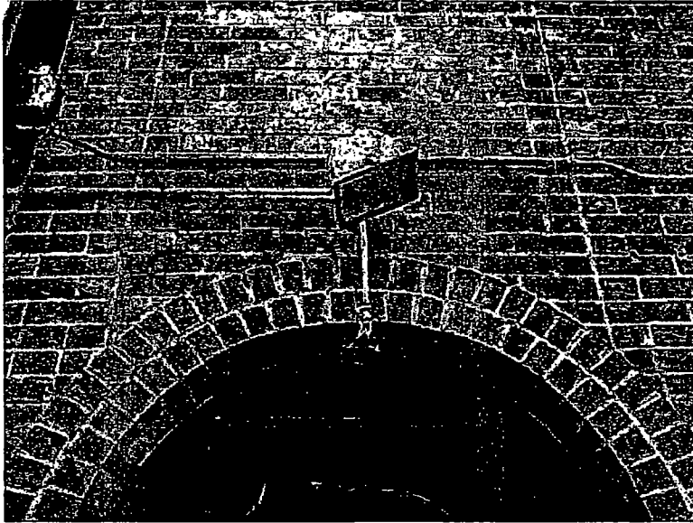
FIGURE 1. PICTURES

ACCOUNT: 85292-7 LOCATION: 4204-4216 W. North Ave. TYPE OF PRIVILEGE: Light Fixture COUNCIL PASSAGE DATE: 06/11/2008 PERMIT TERM: 5 Years EXPIRATION DATE: 06/10/2013