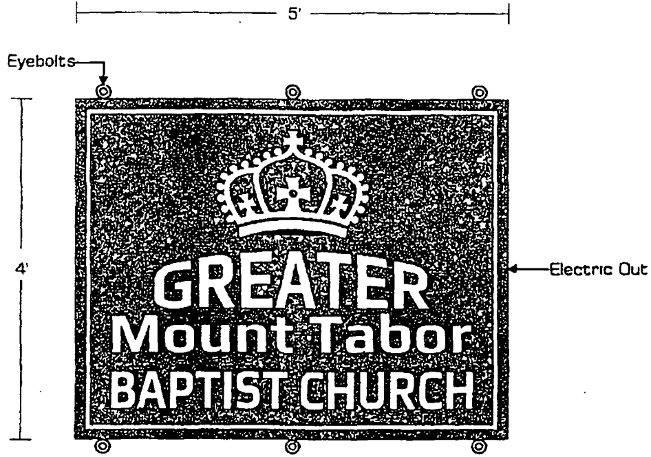
SIGNATURE 45 CABINET SIZE 4x5'