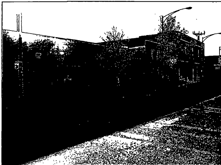
2 VIEW OF EXISTING WAREHOUSE TO BE DEMOLISHED AT NORTH EXTENT OF PROPERTY SCALE: 1/8" = 1'-0"