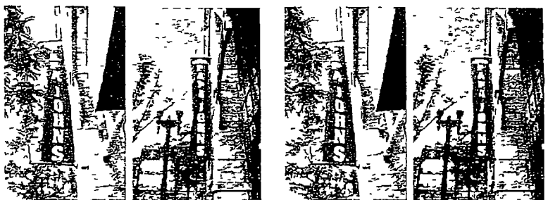
BEFORE (EXISTING BANNERS)