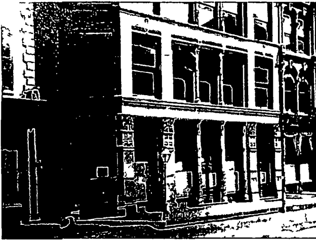
2 HISTORIC STOREFRONT SCALE N T S