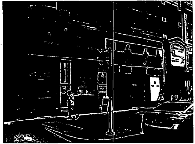
3 EXISTING STOREFRONT SCALE N T S