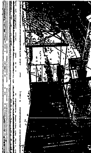
51 E OAK CHICAGO IL PHOTOGRAPHS OF EXISTING FIRE ESCAPE