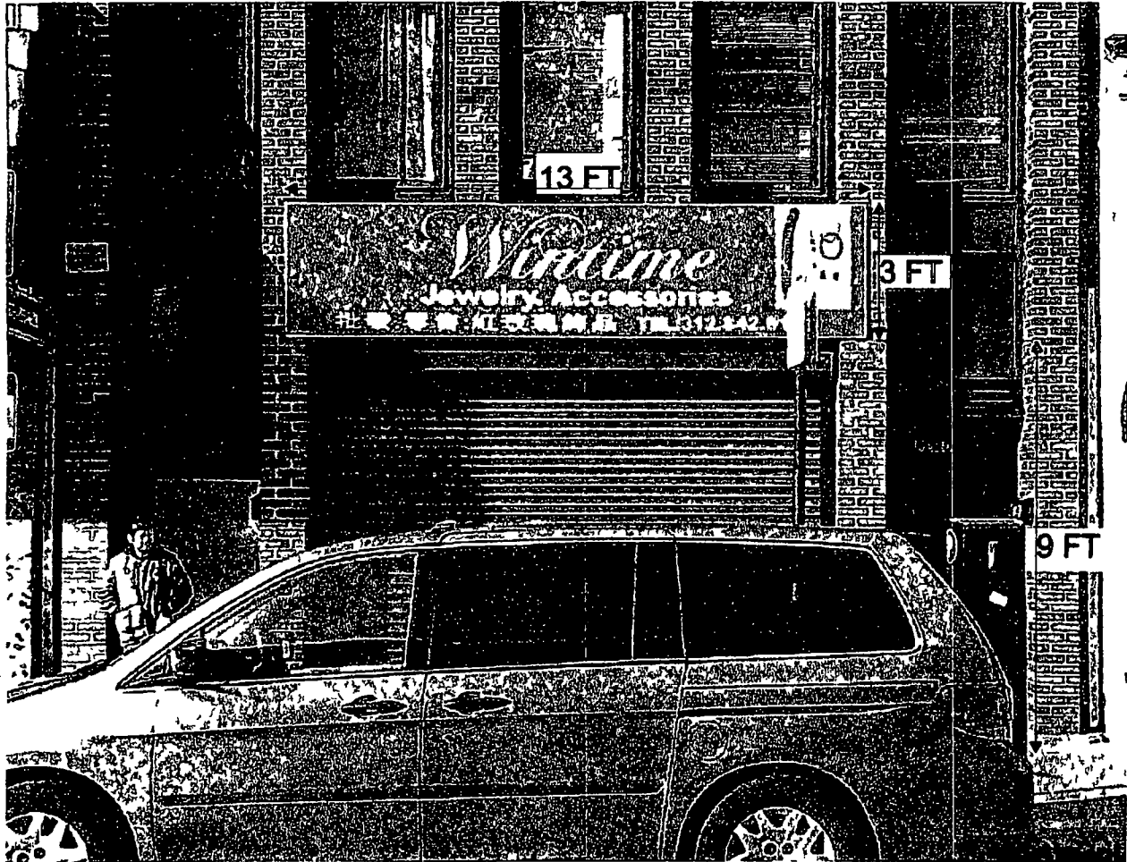
SIDE WALK 10'-6"