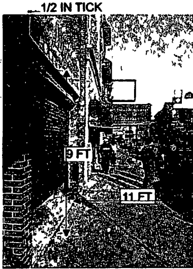
9 FT OFF THE GROUND 11 FT SIDE WALK