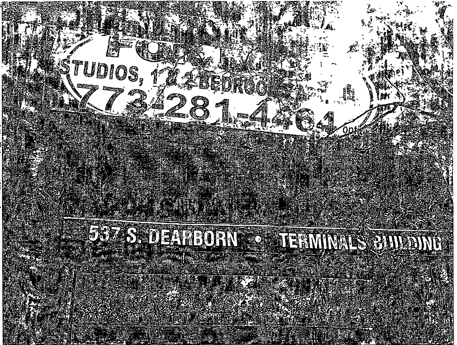
537 S. DEARBORN FRONT DOOR 9'3" x 2'5" @ 7'8" @ ABOVE GRADE