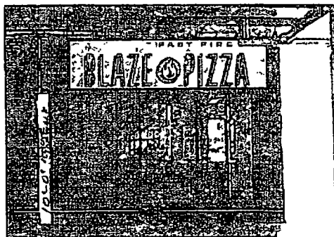
Superimposed wall sign on store side elevation (Survey required)