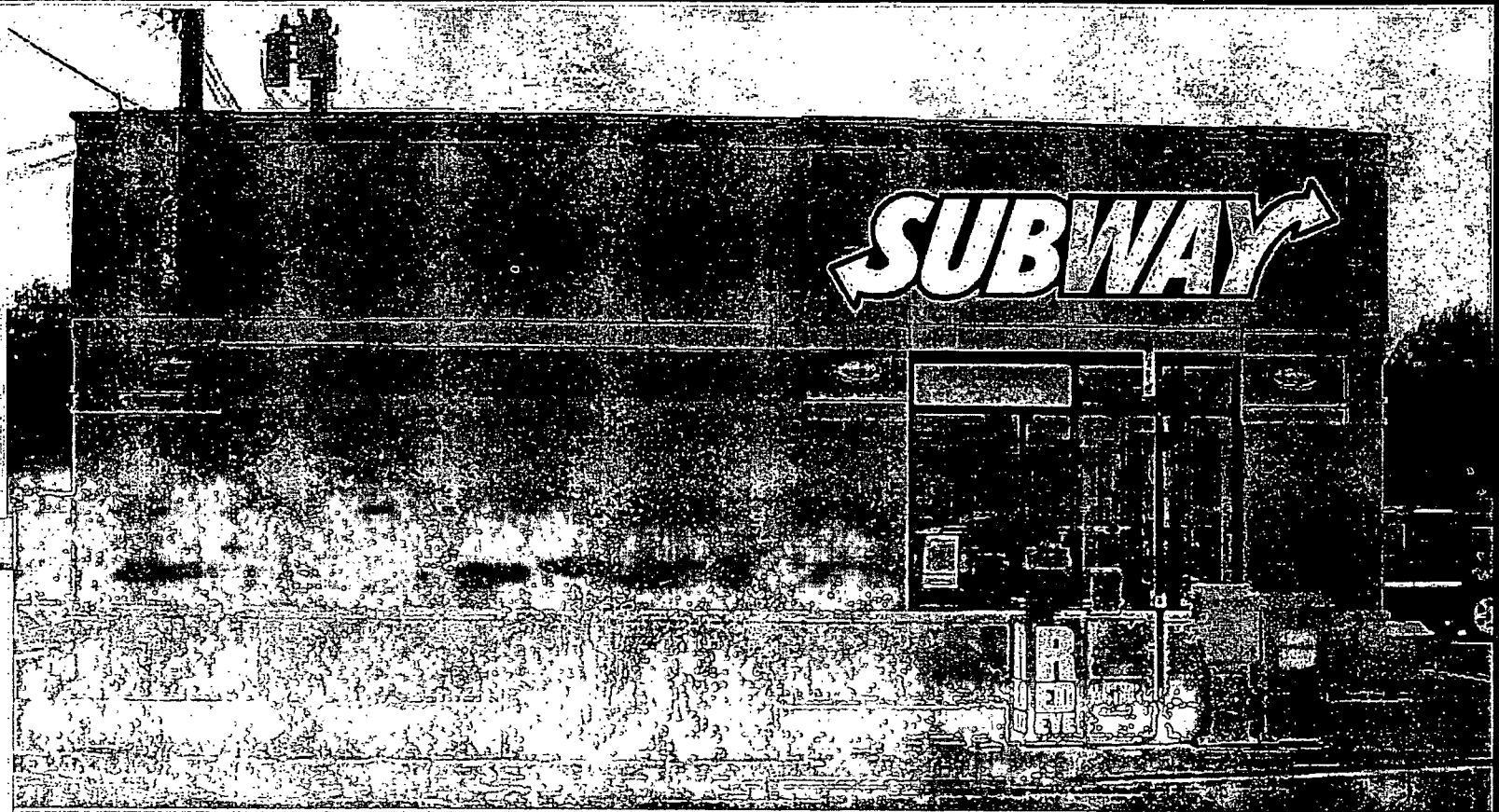
RACEWAY MOUNTED CHANNEL LETTERS USED ILLUMINATION