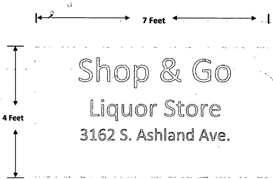
Shop & Go sign