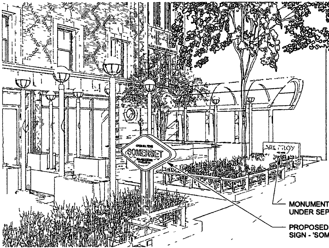
1) SOUTHEAST VIEW FROM SIDEWALK