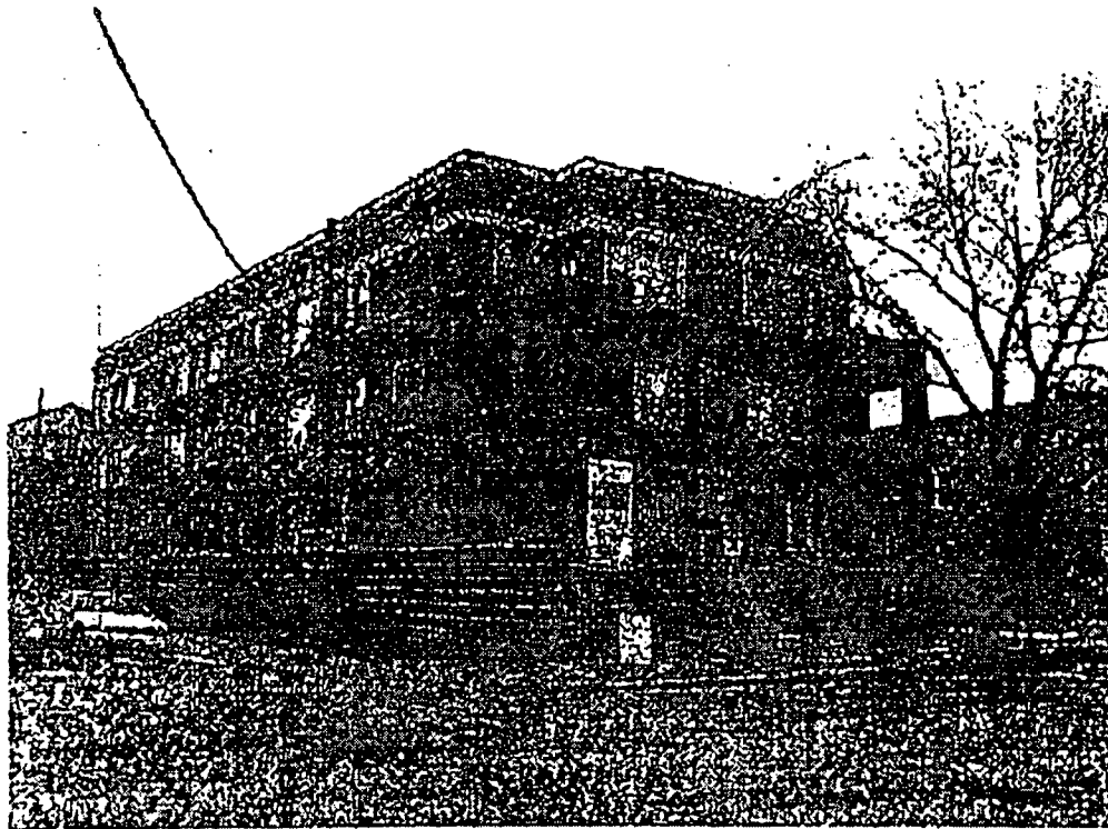
PHOTO: OVERALL - SOUTHWEST CORNER NTS. LOOKING NORTHEAST