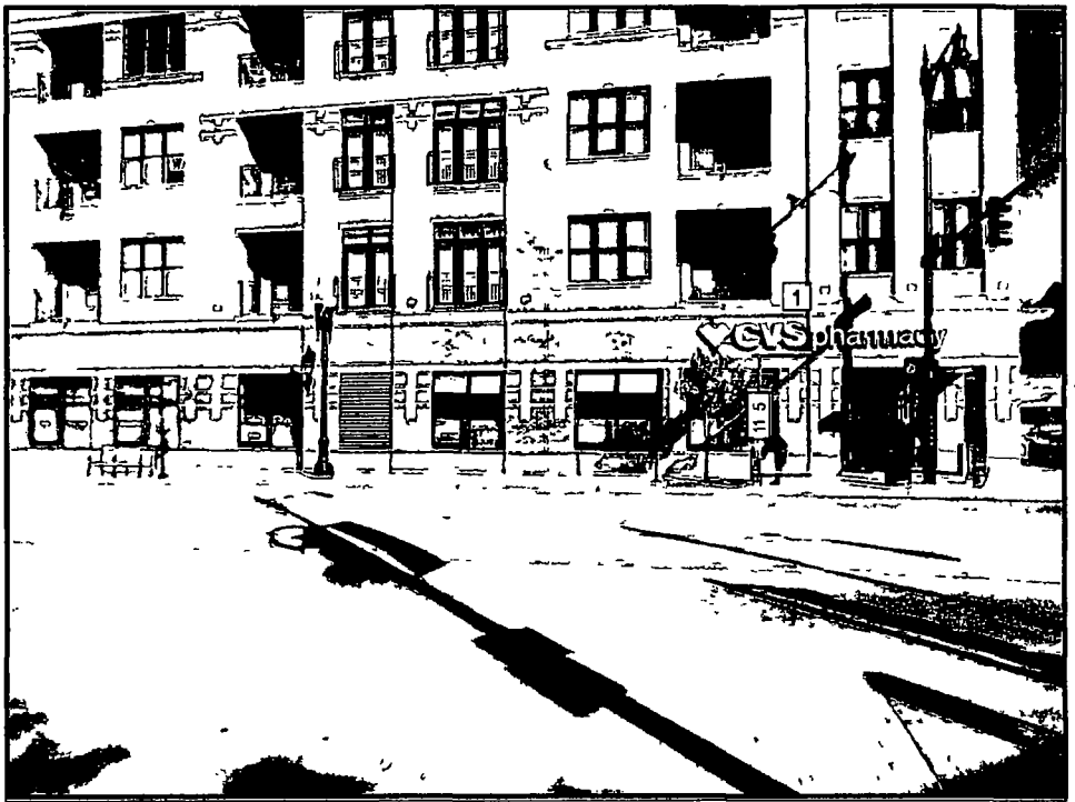
Proposed Signage Elevation