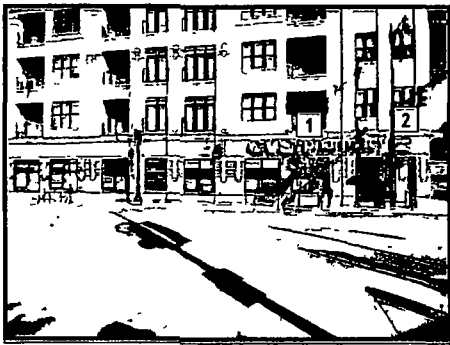
Existing Signage Elevation