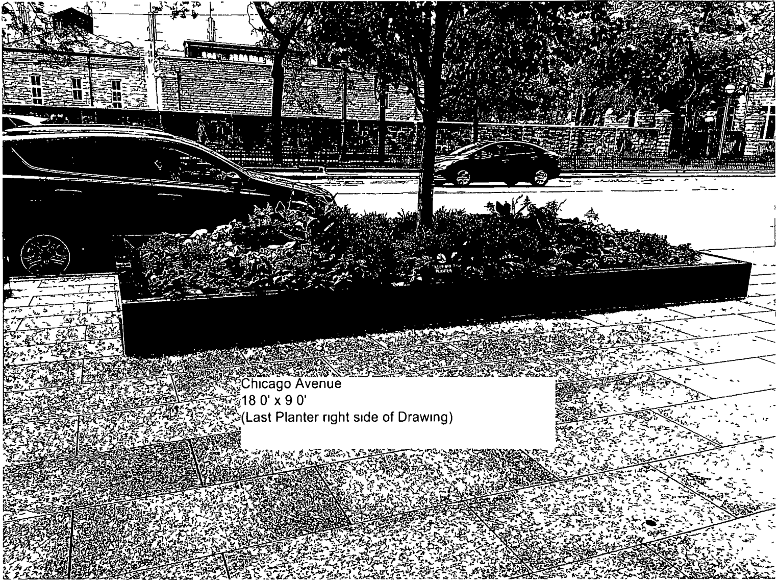
Chicago Avenue 18 0' x 9 0' (Last Planter right side of Drawing)