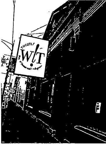
1 View On Belmont Looking East