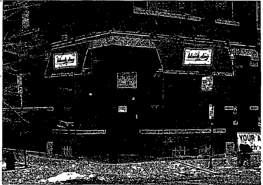
NOTE: Photo for representational purposes only. Signs are not to scale and may appear larger or smaller than shown.