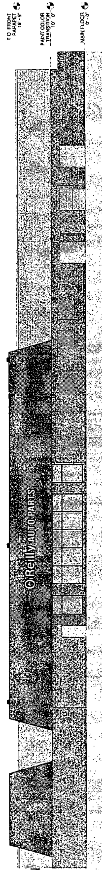
1 SOUTH COLOR EXTERIOR ELEVATION