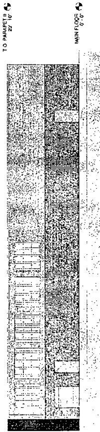
3 NORTH COLOR EXTERIOR ELEVATION