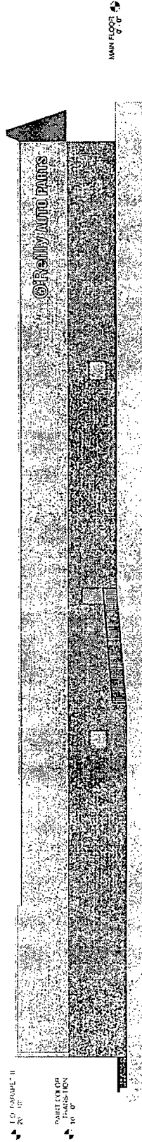
2 WEST COLOR EXTERIOR ELEVATION