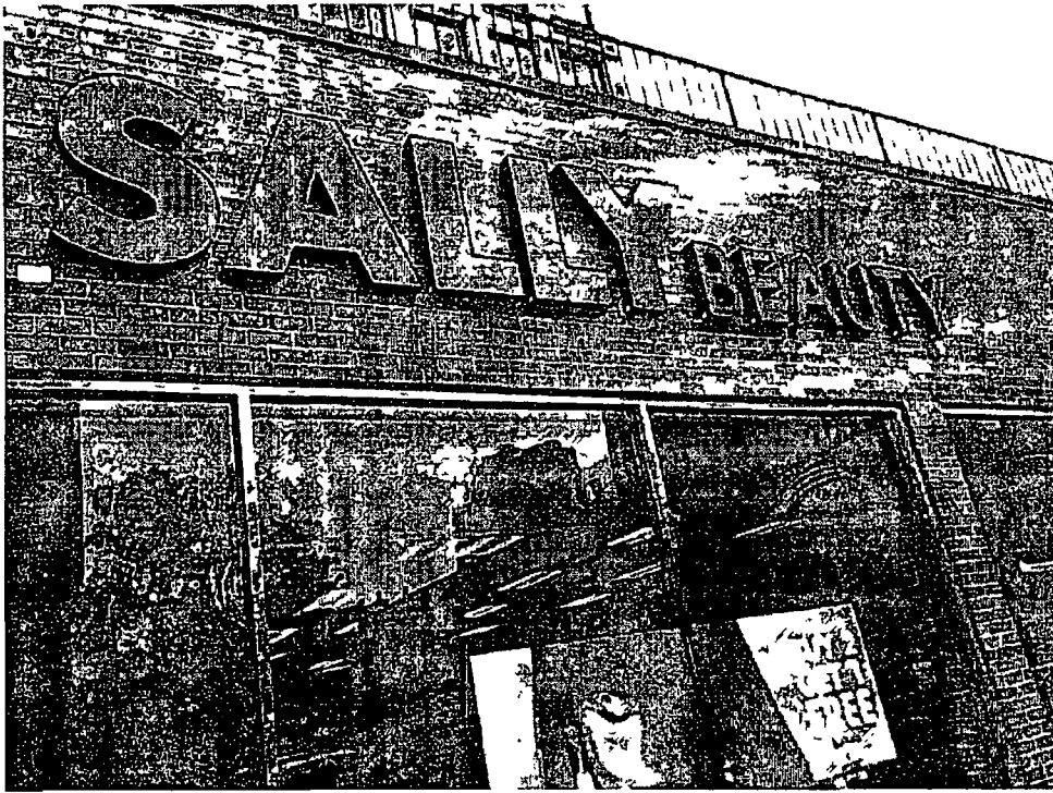
Hope this ok that's is as far back as I can get with out going across the street Sent from my iPad