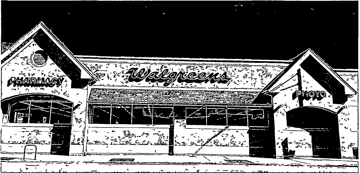
Walgreens #03961 Signs