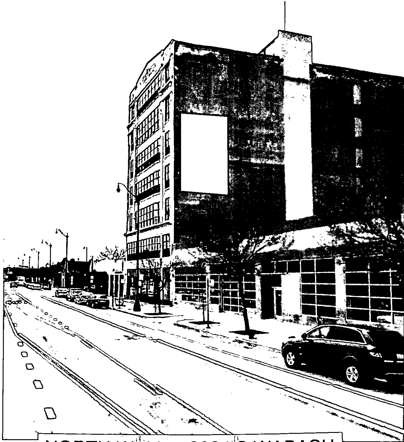
NORTH WALL – 2024 S WABASH