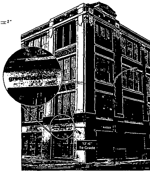
SIGNS #1 & #2