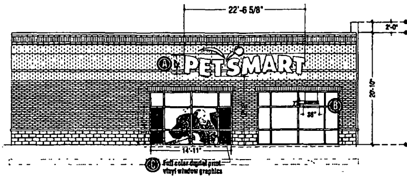
SIDE (EAST) ELEVATION

Site Identification - SIDE Elevation Store #2524 - Chicago, IL