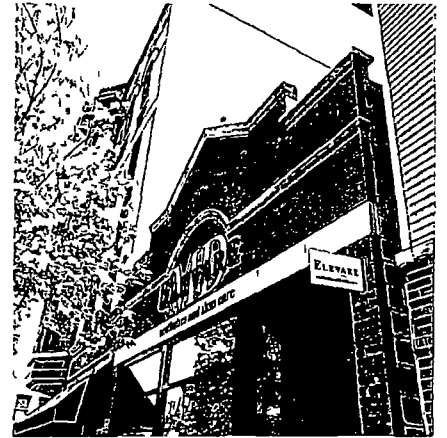
PHOTO SHOWN FOR ILLUSTRATION PURPOSES ONLY NOT TO BE USED FOR ACCURATE DEPICTION!