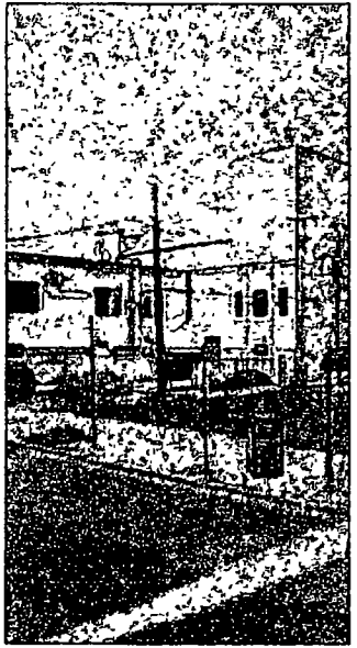
North side Jr. Drive. T