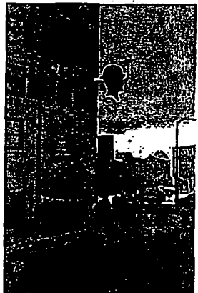
SOUTH ELEVATION VIEW - NTS

Drawn by 1:10 VONES Detailed Construction will be Visible within 2 FEET of View of Installation, Ground 1/2\"/>