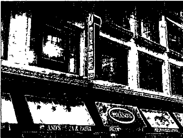
13'6"x1'8" PROJECTING SIGN