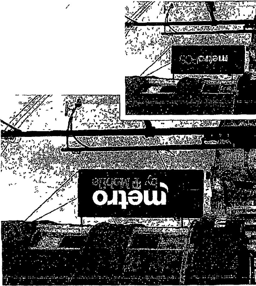
Sign 04 - Proposed (image for reference purposes only) RENDERING IS NOT SCALED